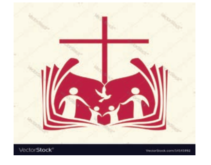
Humanae Vitae , 50 Years and Prophetically Still Relevant

"I love you!" Important words for every child to hear, but knowing what these words mean is even more significant. Loving someone is about looking outward beyond our own needs and wants to see what is best for the other; it is caring and compassion; it is empathy and mutual respect. In short, love is more about what we give to a relationship than what we get from it. For our children, teaching them about good relationships and the true meaning of love allows them to love in a mature way when they get older and to expect a healthy love for themselves.